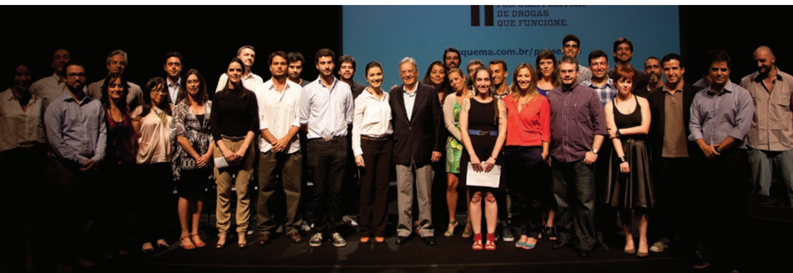
Pense Livre Network members during the network launch in São Paulo. At the center, the former president of Brazil, Fernando Henrique Cardoso.

Meeting of the Latin American Drug Policy Initiative with former Presidents Fernando Henrique Cardoso and Cesar Gaviria São Paulo, January/12