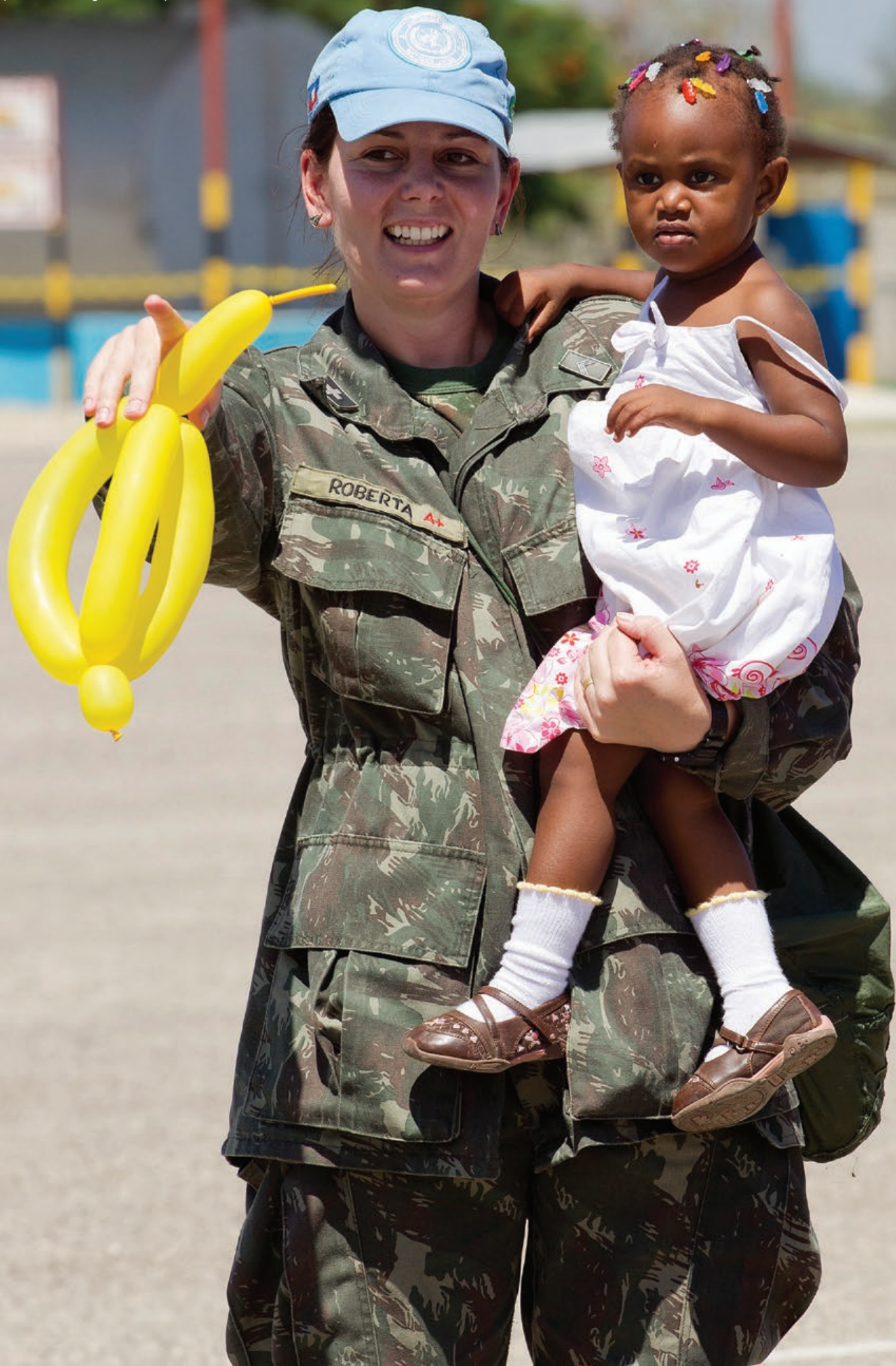
Brazilian peacekeeper holds a child in an activity day with children of Cité-Soleil slum in the Haitian capital Port au Prince.