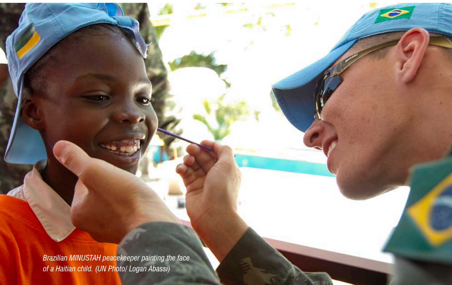
Brazilian MINUSTAH peacekeeper painting the face of a Haitian child.

There are many ways that Igarapé has sought to mobilize changes in public opinion. Igarapé's advocacy efforts are advanced through the publication of Strategic Notes, Strategic Papers, and policy and academic articles; international and national seminars, workshops and training courses; nurturing of a new generation of leaders; creating mechanisms for identifying and preparing civilians for deployment in unstable settings; creating systems for monitoring security and development; and sustaining a presence in mainstream and social media.