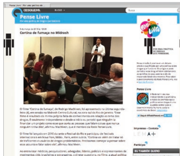
The Pense Livre blog contributes to the drug policy debate in Brazil.

In 2012, the Igarapé Institute invested considerable time and energy into publicizing its activities and products in both the national and international media. The Institute raised its digital profile through online social networks by creating a basic website ( www.igarape.org.br ), Facebook page ( www.facebook.com/institutoigarape ), and through the active use of Twitter and other media outlets including blogs as onthinktanks, googleblog.blogspot.com.br and www.worldwewant2015.org among others. By the end of 2012, Igarapé Institute averaged between 75-90,000 hits on its website each month.