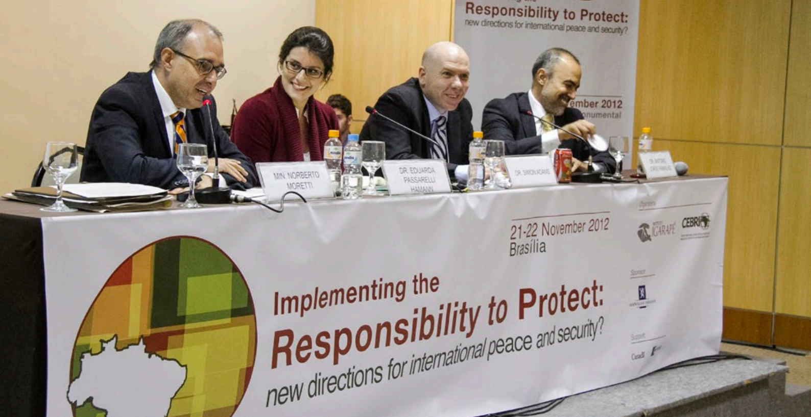
Meeting on the Responsibility to Protect organized by Igarapé Institute and attended by diplomats and military personnel from Brazil and abroad.