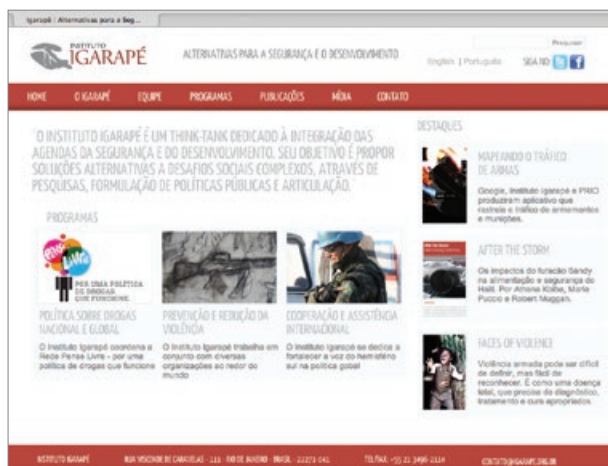
The Igarapé Institute homepage is regularly updated.