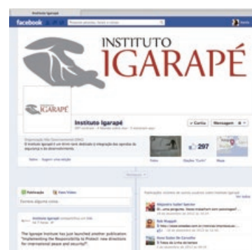
Igarape Institute regularly uses social media, including advertising events and outputs on Facebook and Twitter

Innovations developed by the Igarapé Institute have sparked great interest from the general media, digital community as well as specialized sectors working on violence prevention and arms control. Specifically, the MAD app generated massive national and international coverage for its launch in August 2012, including hundreds of thousands of webhits as well as some 15,500 Youtube views since its launch. This tool is now one of the most frequently accessed items on the Institution's site and has also spurred on new cooperation opportunities with the Federal Police, the Rio Olympic Committee, and the PMERJ in 2013.