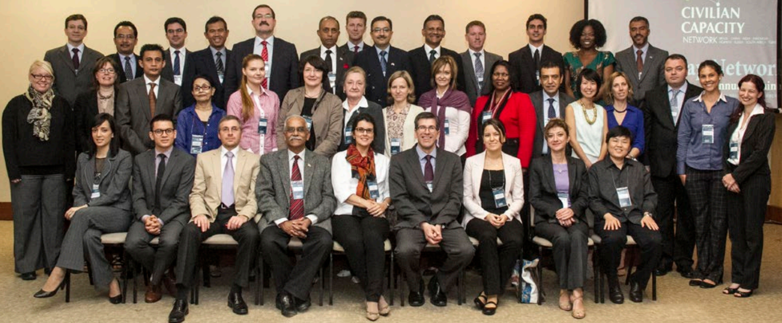
International Network of Civilian Capacity first meeting gathered representatives from India, Indonesia, Norway, South Africa, Brazil, Russia and Turkey. Brasília (DF). (Kenia Ribeiro)