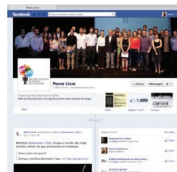
Pense Livre is popular on social media sites, including Facebook